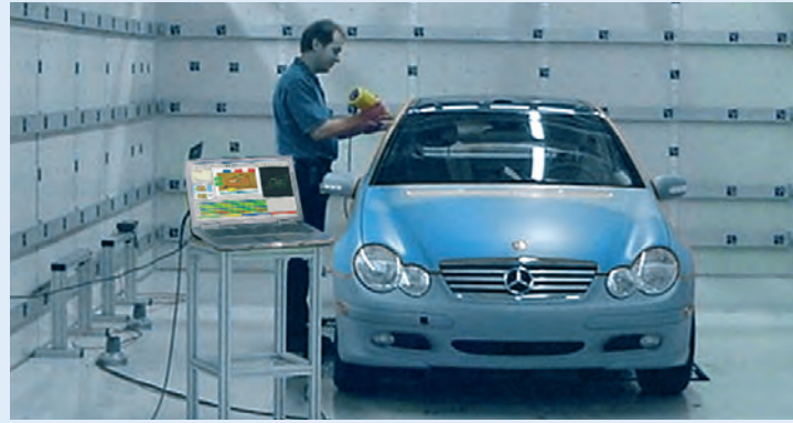
Application in a pre-calibrated room

The lightweight, hand held probe is ergonomically designed. Measurements are triggered easily by pushing the button on the handle. The reference targets are then illuminated by the integrated infrared ring flash, and the system calculates, displays, and records the coordinates of the probe tip. ProCam operates independently of surrounding light.